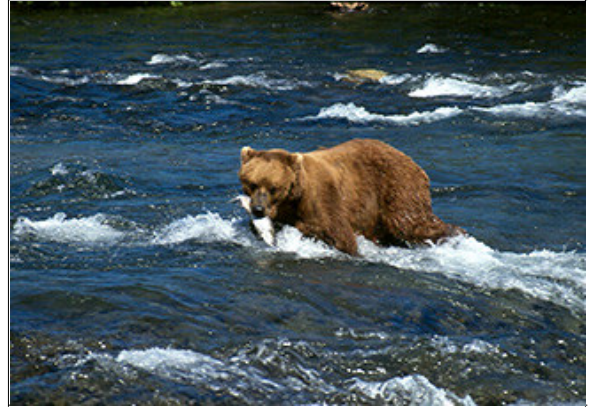
Brown bears at the Katmai National Preserve are at the crux of conflict between those who favor hunting and others who want to maintain or expand ecotourism in Alaska.

Click here to read the NPCA letter to NPS.